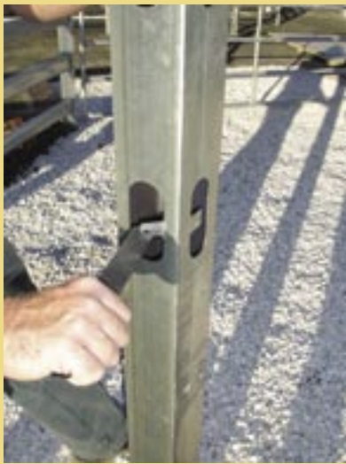
New patented FlexiTab makes it easy for you.

Our patented FlexiTab makes RediPost the simplest and easiest method there is for installing Cattle Rail, because there's no welding required. Set your RediPost in the ground, bend the FlexiTab out to accomodate the Cattle Rail, then Tek Screw it in and you're done! And what's more, it works on both straight and angled joins!