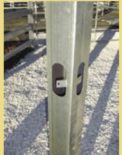
Corner Stays are made easy with RediPost.